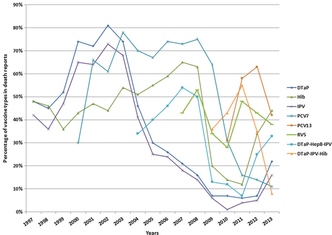
Figure 2. Trends in death reports by vaccine type in children aged 0–17 years, Vaccine Adverse Event Reporting System, 1 July 1997–31 December 2013. Only the most common vaccines associated with death reports are shown. Vaccines shown may be given alone or with other vaccines and may be single or combined antigen vaccines, so percentages of death reports in any given year may exceed 100%. Abbreviations: DTaP, diphtheria, tetanus, and acellular pertussis vaccine; DTaP-HepB-IPV, combination diphtheria, tetanus, and acellular pertussis, hepatitis B, and inactivated poliovirus vaccine; DTaP-IPV-Hib, combination diphtheria, tetanus, and acellular pertussis, inactivated poliovirus and Haemophilus influenzae type b conjugate vaccine; HepB, hepatitis B vaccine; Hib, Haemophilus influenzae type b conjugate vaccine; IPV, inactivated poliovirus vaccine; PCV7, 7-valent pneumococcal conjugate vaccine; PCV13, 13-valent pneumococcal conjugate vaccine; RV5, rotavirus vaccine (pentavalent).

of life. HepB vaccine was the second most common vaccine associated with death reports. A previous study investigated neonatal death reports submitted to VAERS after HepB vaccine during 1991 through 1998 and did not find any safety pattern of concern [24], and a population-based study did not find a significant difference in the proportion of HepB-vaccinated (31%) and -unvaccinated (35%) neonates dying of unexpected causes [25].