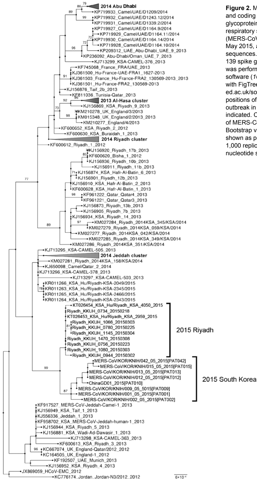
Figure 2. Molecular phylogenetic tree and coding region variants for spike glycoprotein genes of Middle East respiratory syndrome coronavirus (MERS-CoV) isolates from South Korea, May 2015, and reference MERS-CoV sequences. Phylogenetic analysis of 139 spike glycoprotein gene sequences was performed by using RAxML software (10). Tree was visualized with FigTree v.1.4 ( http://tree.bio.ed.ac.uk/software/figtree ). Taxonomic positions of circulating strains from the outbreak in South Korea and Riyadh are indicated. Compressed major clades of MERS-CoV are indicated in bold. Bootstrap values (>70%) on nodes are shown as percentages on the basis of 1,000 replicates. Scale bar indicates nucleotide substitutions per site.